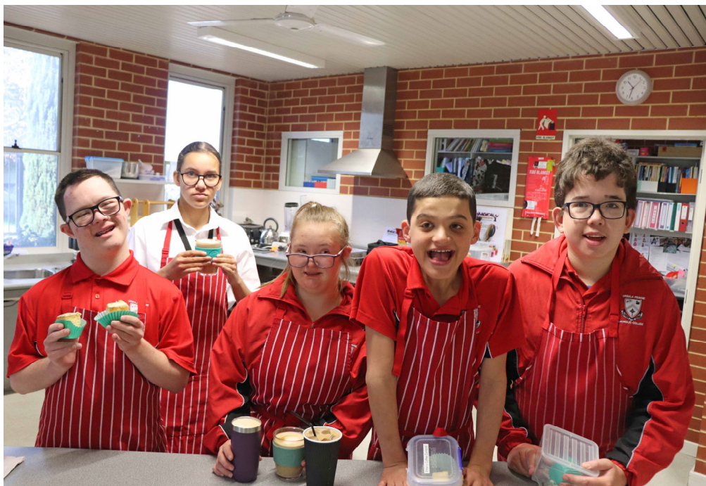
Students from Magical Creations getting ready to deliver coffee and cake orders to staff.

admin@ufcc.wa.edu.au https://www.ufcc.wa.edu.au