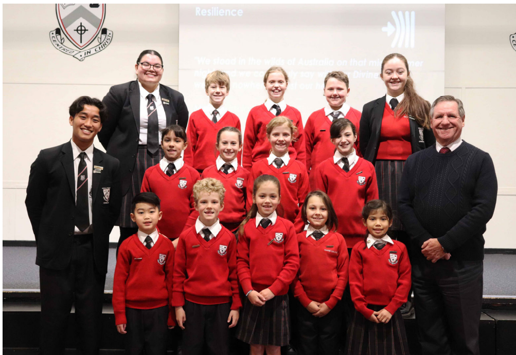
Semester Two Balmoral Street Campus Student Representative Council. See article on Page 4