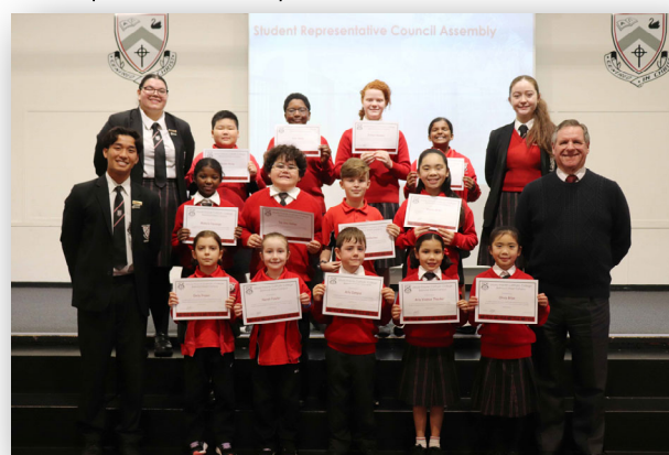
Semester One Student Representative Council