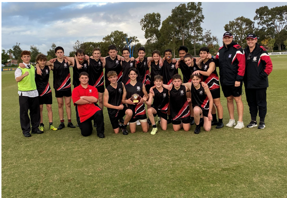
CONGRATULATIONS - Years 8/9 Boys' AFL Team for winning the Grand Final in the Eagles Schoolboys Cup against St Norbert. Well Done!