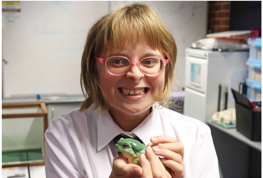
Students in Education Support enjoyed a reptile incursion today with visitors including snakes, lizards and this very green frog.

admin@ufcc.wa.edu.au https://www.ufcc.wa.edu.au